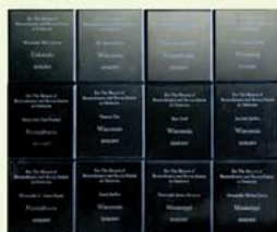
Individual stone plates from a group of American members of the House of the Representatives