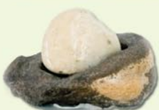
A stone from Be'er Sheva Lions Club, Israel