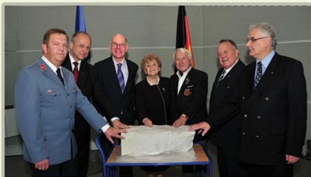
On October 7th 2010 Prof. Norbert Lammert, President of the German Parliament donated a stone from the facade of the Reichstag Building for the Peace Mound Center.

Each stone symbolizes the trek prisoners made carrying large heavy stones they were beaten and starving during their captivity. Many special and symbolic stones have been donated form all over the world for use in the exhibit which will be located inside the Peace Mound Center.