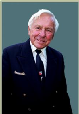
Polish Senior Citizens Union

Extract from a prayer to the United Nations Stephen Vincent Benét