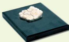
A part of the Chapel of Nazareth (Israel)