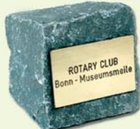
Rotary Club Bonn - Museumsmeile