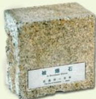
Mr. Tadatoshi Akiba – City of Hiroshima, Japan