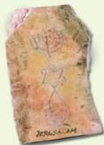
A stone from one of the oldest Christian temples in Jerusalem