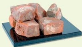
Bricks from the mausoleum of the City of Volgograd - Stalingrad (Russia)