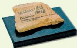
A part of a tile from Nagasaki (Japan) destroyed by a nuclear bomb.