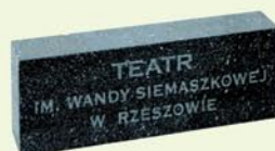
Stone from Wanda Siemaszkowa Theatre in Rzeszow (Poland)